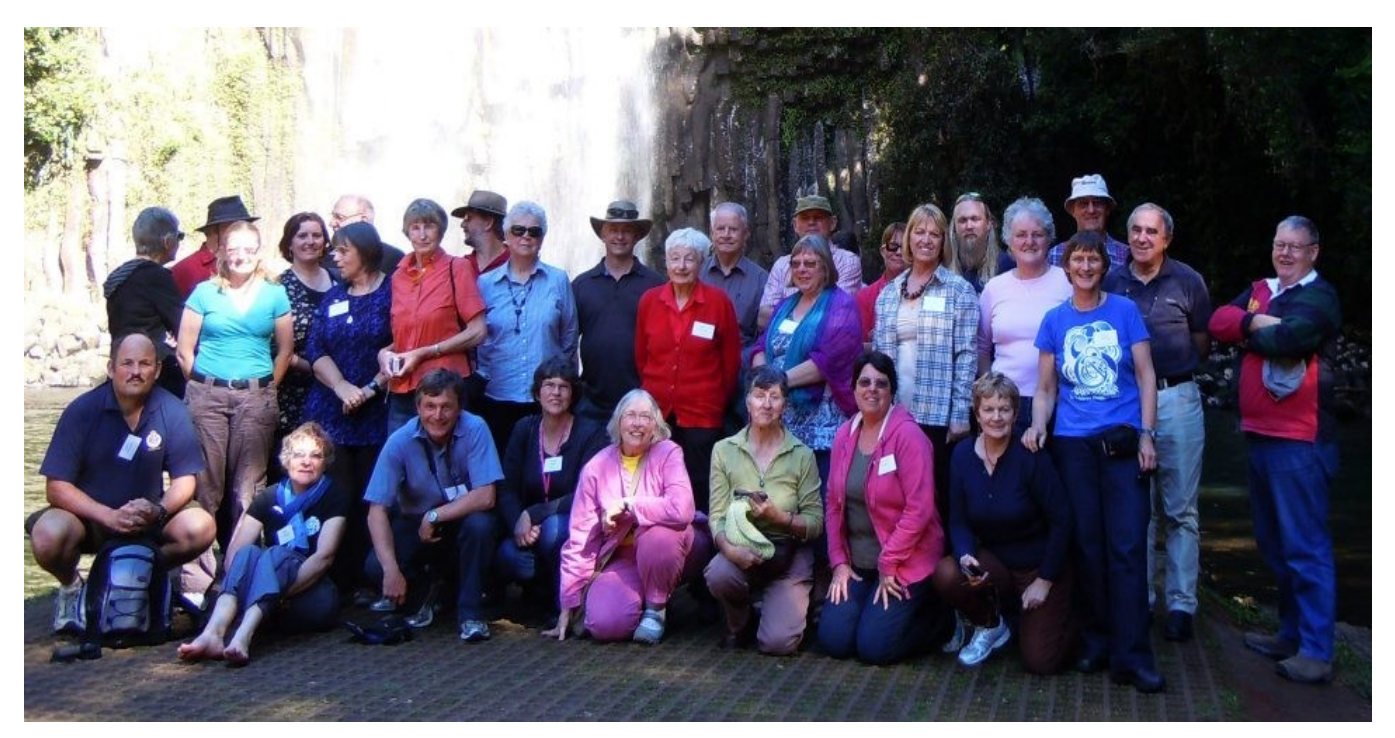
Milla Millaa Falls: Somehow we managed to get ourselves to stand together at the same time. Not easy when you get a bunch of Australians and New Zealanders together on a bus trip

We also heard a number of very sacrificially shared stories on that first day, shared from the heart.