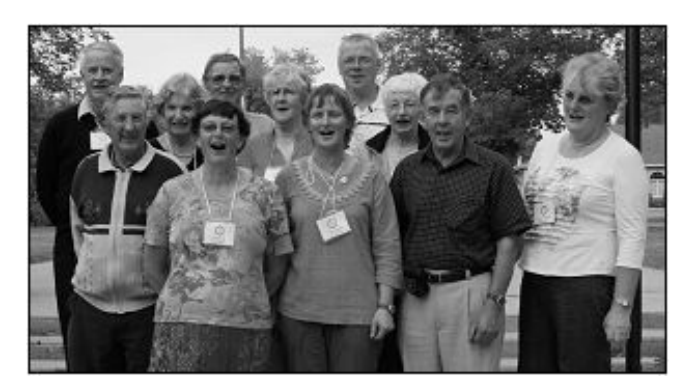
The Kiwi contingent gives a hearty rendering of 'God Defend New Zealand' – in Maori of course!